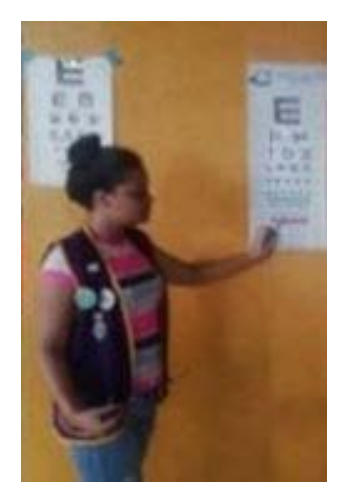
Chart Eye Exam

Many thanks to these dedicated Lions and FONIPRECE volunteers for their service.