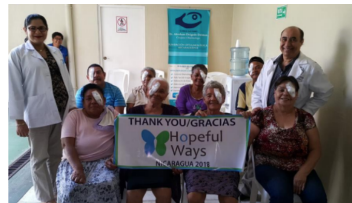
Cataract Surgery Recipients