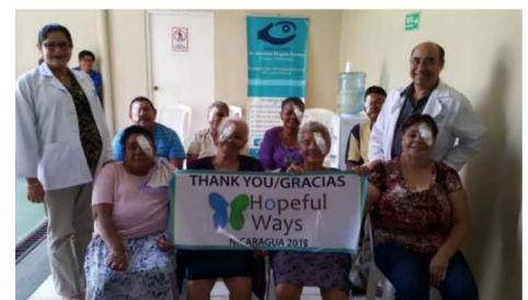
Cataract Surgery Recipients