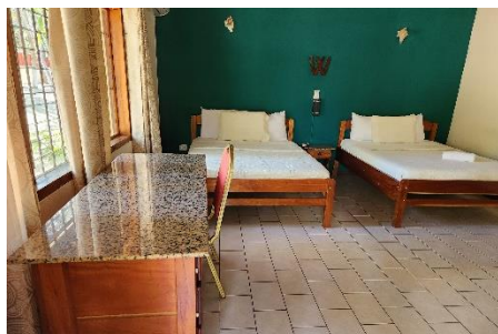
Hotel El Regalo Typical Hotel Room