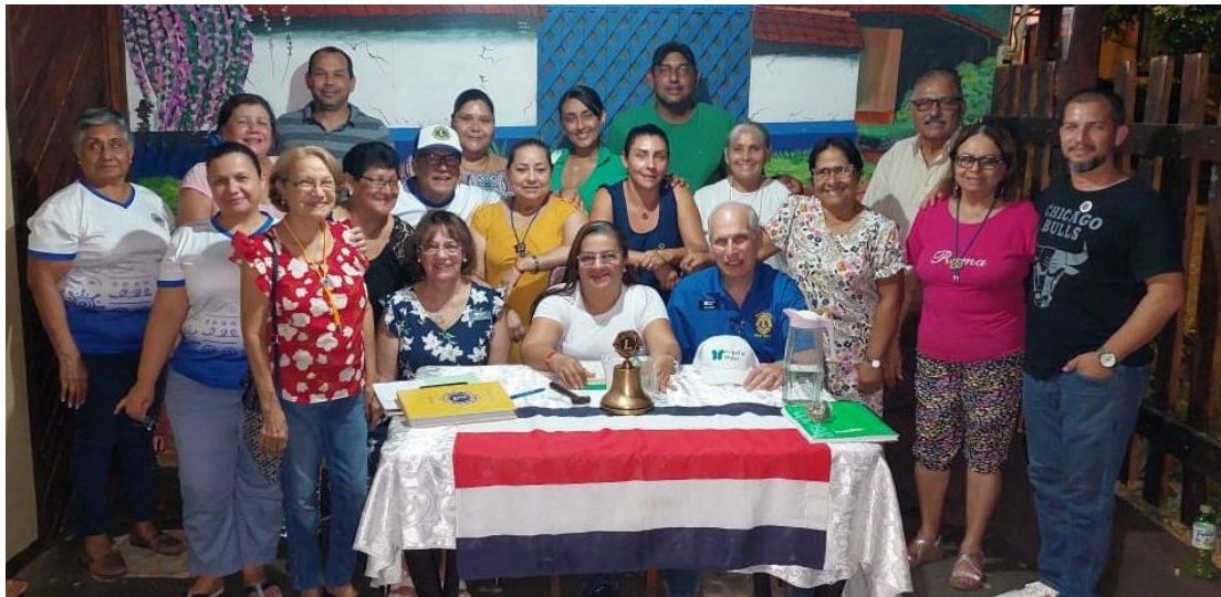
Nicoya Lions Club Meeting