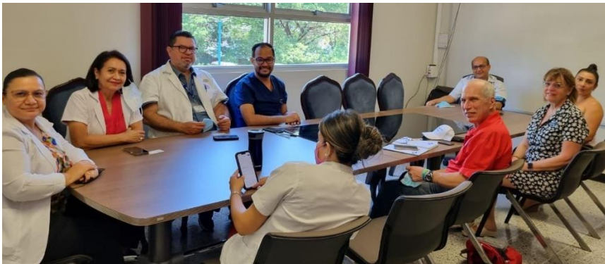
Meeting with Hospital Doctors and Administrators