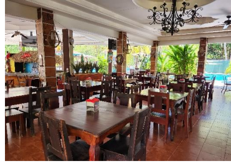
Hotel El Regalo Restaurant