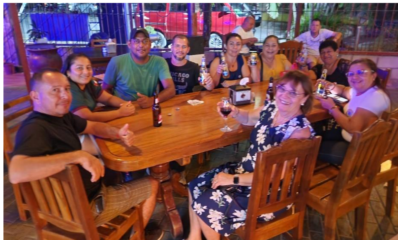
Social Gathering after Nicoya Lions Club Meeting