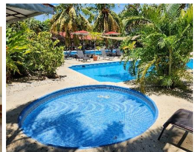
Hotel El Regalo Pool Area