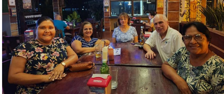
Meeting with Nicoya Lions Leadership