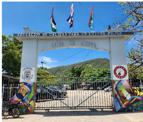
Clinic Site Entrance at Liceo School